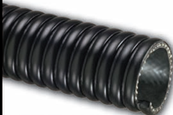
TIGER™ - SD