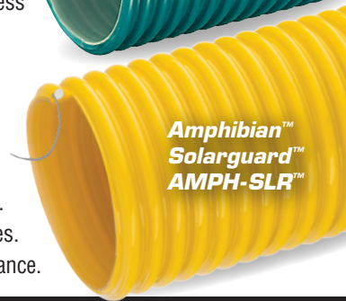
Amphibian™ Solarguard™ AMPH-SLR™